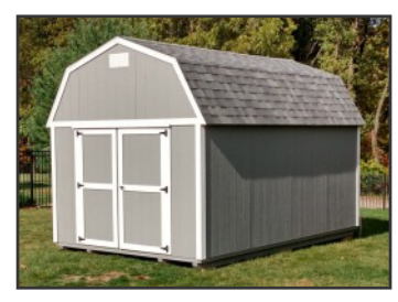
Includes two lofts