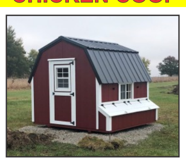
<u>Size</u> <u>Model</u> Retail 7ft.x8ft. M075 $6497 9ft.x8ft. M076 $7085 11ft.x8ft. M077 $7675

Includes roosting bar, nesting box, chicken door, windows and entry door