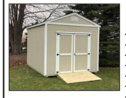
<u>Size</u> Retail Model 8ft.x8ft. M020 $5777 8ft.x12ft. M021 $6501 10ft.x12ft. M022 $7482 10ft.x16ft. M023 $8040 10ft.x20ft. M024 $9087 12ft.x16ft. M<sub>025</sub> $9463 12ft.x24ft. M026 $11,561 12ft.x32ft. M027 $13,822 14ft.x40ft. M028 $20,233