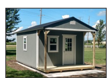
We can quote finished interior