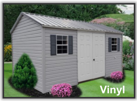
Shutters shown optional

Choice of wood or vinyl siding, choice of shingle or metal roof, double doors, and 2 windows. *8x12, 10x12, and 12x14 come with 1 window