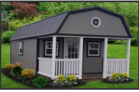
Available in Gambrel style, call for quote!