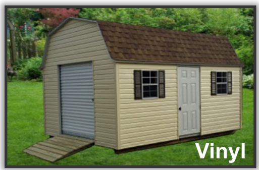
Ramp, side door, windows & shutters shown optional

Choice of wood or vinyl siding, choice of shingle or metal roof, 8' loft, and double doors or 6' roll-up door. *8' Wide comes with 5' roll-up door