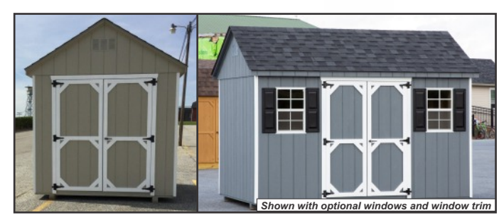
All 6' & 8' wide buildings come with a single door. All 10' wide and larger buildings come with double doors.

Size Model Retail 6ft.x8ft. HPB16 $2820 6ft.x10ft. HPB17 $3170 8ft.x8ft. HPB18 $3327 8ft.x10ft. HPB19 $3645 8ft.x12ft. HPB20 $4055 8ft.x16ft. HPB21 $4677 10ft.x10ft, HPB22 $4416 10ft.x12ft. HPB23 $4745 10ft.x14ft. HPB24 $5145 10ft.x16ft. HPB25 $5484 10ft.x20ft. HPB26 $6717