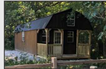
We can quote finished interior