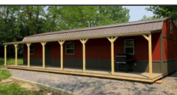
We can quote finished interior